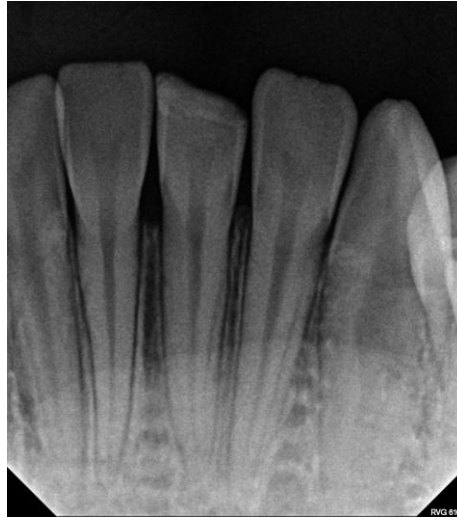
Pre – Op # 24