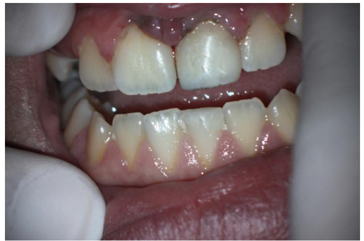
Post-op clinical image. Esthetic composite restorations placed.