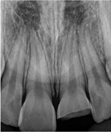
Pre – Op # 9