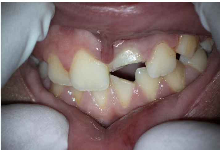
Pre-op clinical image.