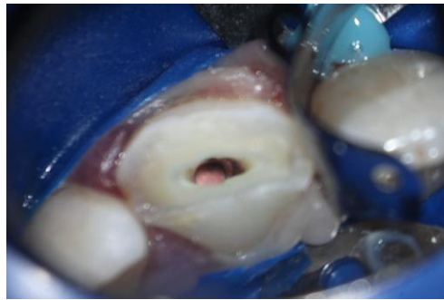
Obturation and post space.