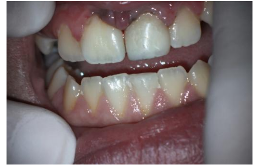
Post-op clinical image. Esthetic composite buildups placed.