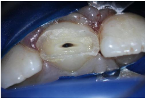
Root canal system cleaned and shaped.